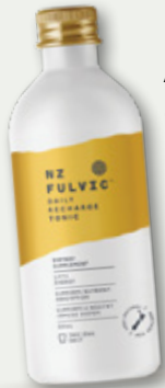
A LIPOSOMAL VIT C + FULVIC ACID